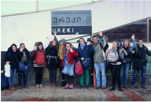
Spring Gathering 2015 in Ureki, Georgia